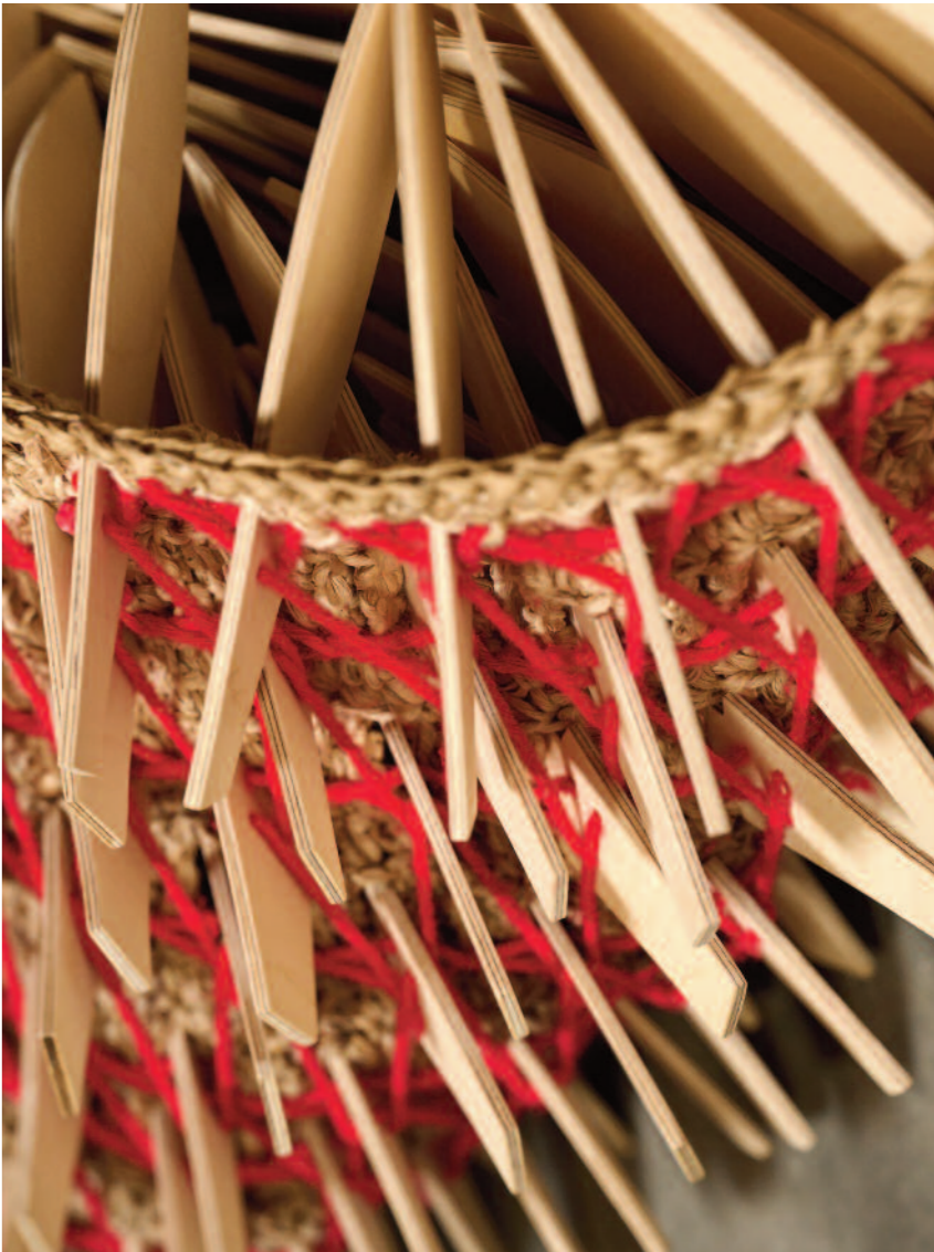
Sculpture Hemp, linen and reinforced paper yarn crocheted, poplar plywood, cotton string. 225 x 95 cm - 10 kg