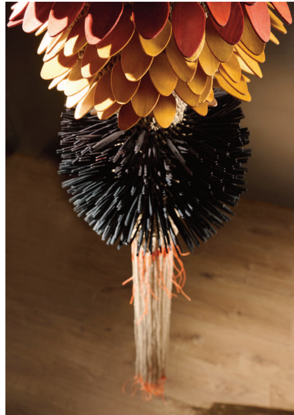
Sculpture Crocheted linen thread, dyed teaspoons and cocktail sticks, hemp string, butcher hook. 26 x 200 cm - 2 kg