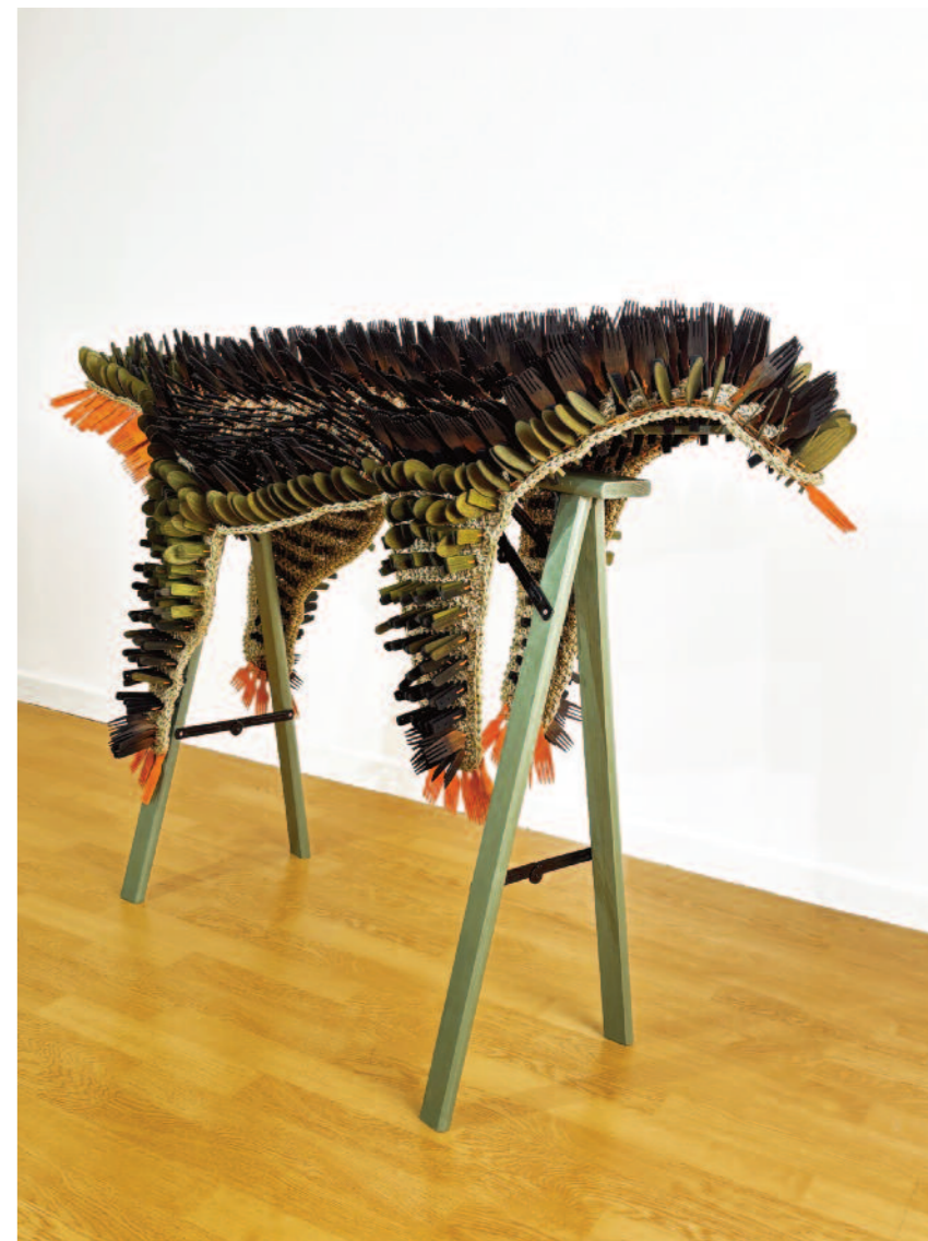
Sculpture Reinforced paper and crocheted linen thread, dyed bamboo spoons and forks, waxed thread, wooden trestle. 155 x 115 x 13 cm - 5,2 kg (out of support)