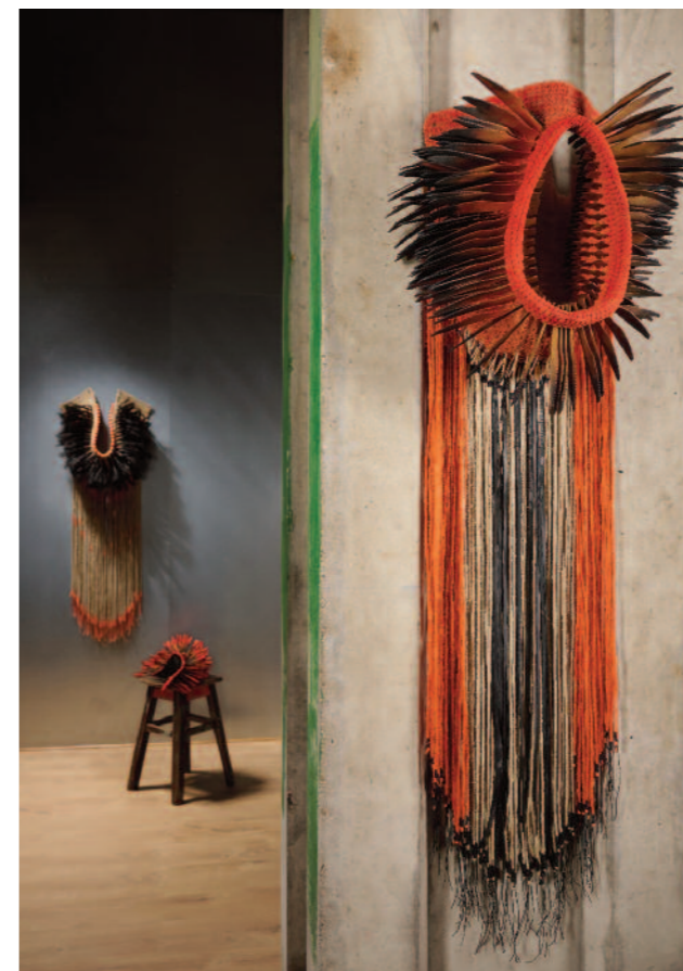
Wall art Crocheted linen thread, hemp and jute string, inner tube ribbons, bamboo spoons and knives. 40 x 138 cm - 1,8 kg